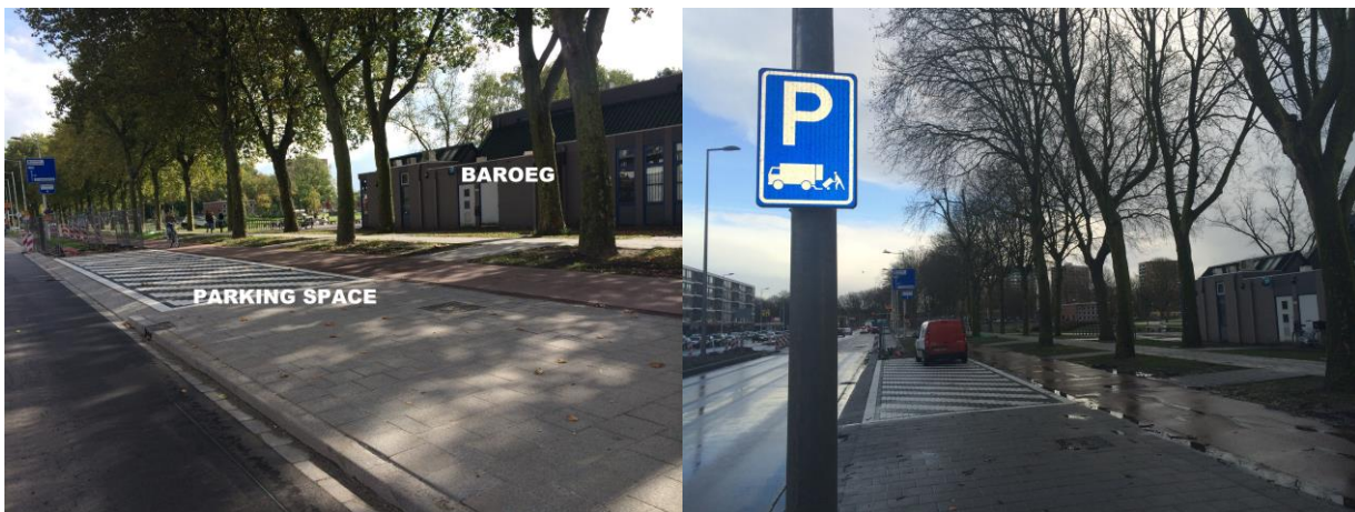
3. Parking space for nightliners & vans

You can park your van or nightliner next to the road, as shown in the third picture. Please note that officially it's not a parking space, but an unloading location (picture nr. 4). This means that unfortunately it's not allowed to park cars there. After unloading, please park your car on the other side of the street!