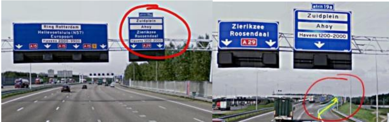
1. Ringway A15

Baroeg is located at the right of this road (at the edge of a small park) and across the street is a variety of shops. It's a grey building with colorful graffiti on the back and front.